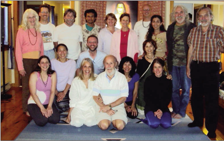
Silent Retreat participants June 27, 2010 at Quebec ashram.